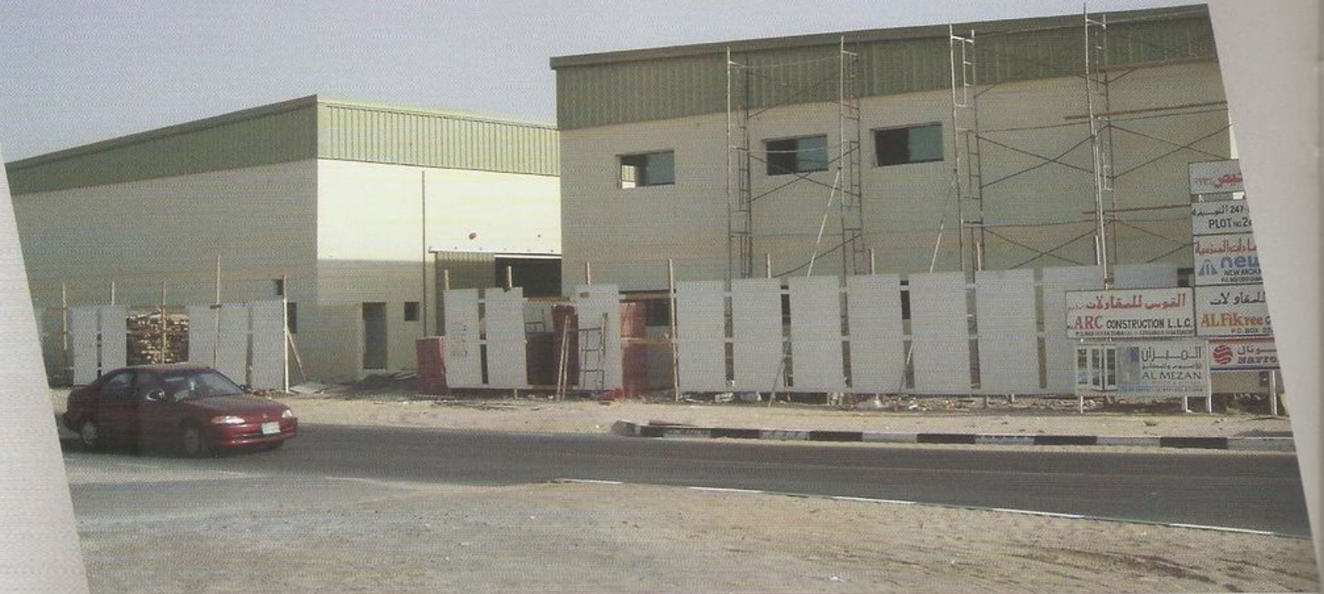
ARC. Cont. Co. - Dubai