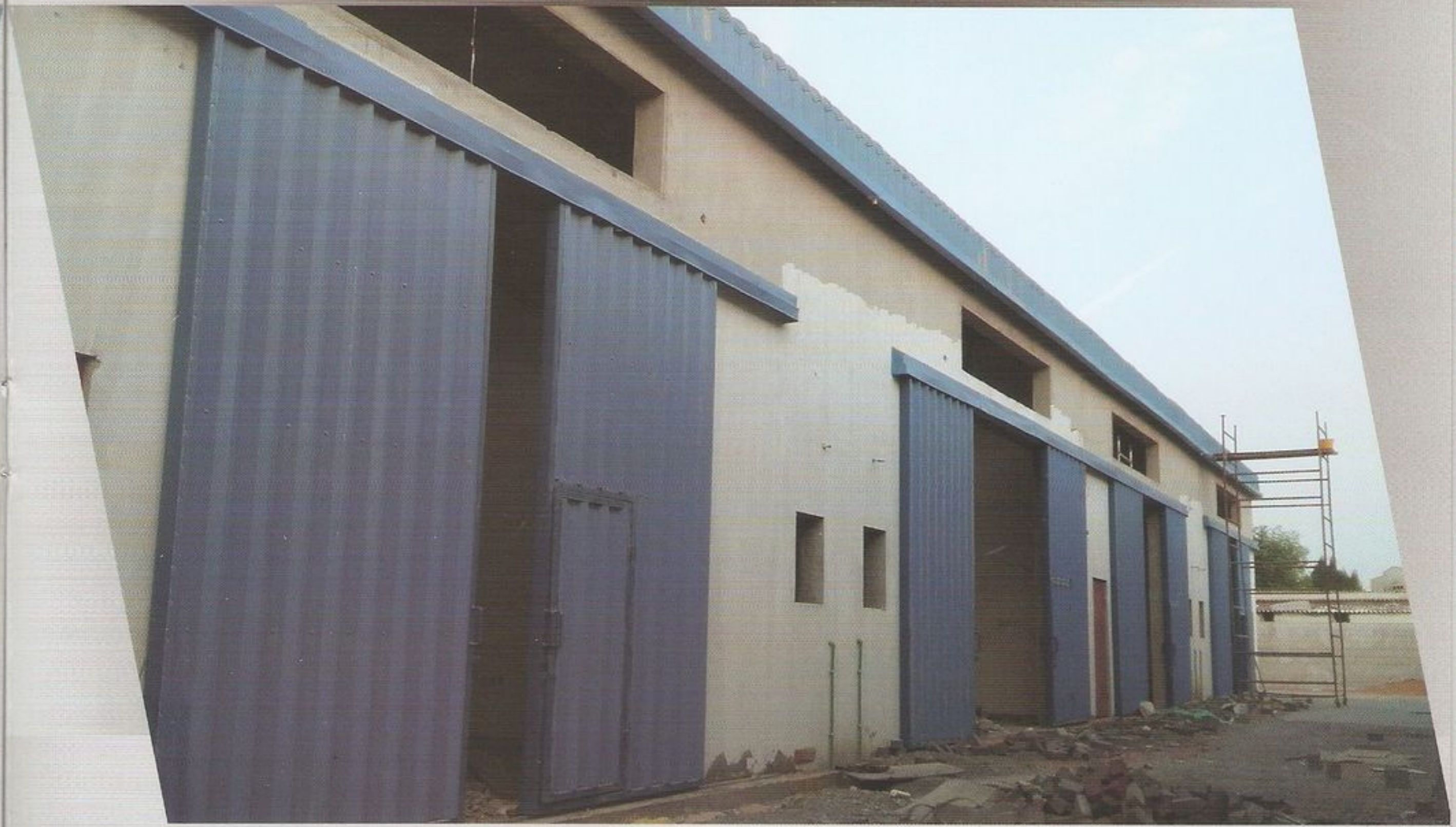
Speedex Tools, Dubai - Al Quoz