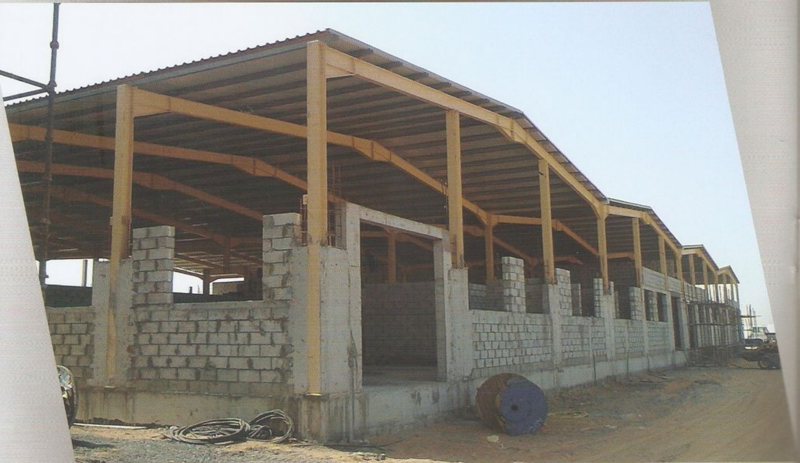
Fast Bldg. Cont. - UAQ.