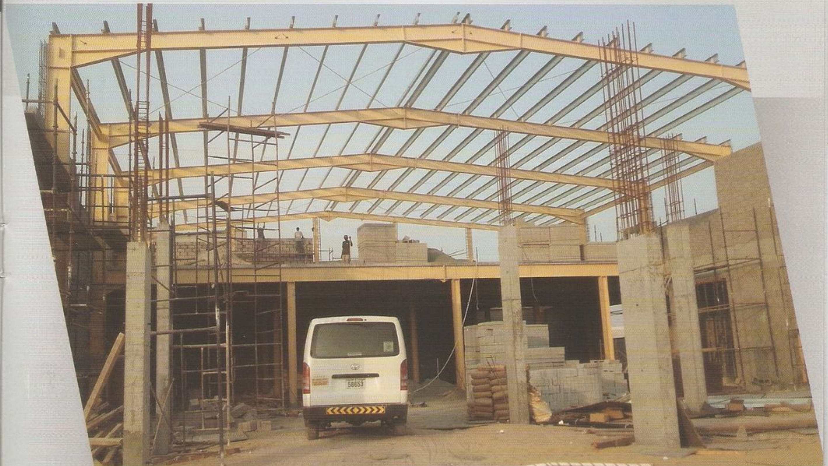
Lolat Al Bustan Cont., Ajman - Jurf